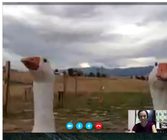
International Conference Call, 2016, digital image, dimensions variable

Things happen when and where you need them to. My housemates and I ran a gallery space together out of our garage for two years. We were fresh out of undergrad and wanted to see what people around us were making, meet artists, and have a place where younger people could have a show. It was a great experience but we got burned out and wanted to move on to new areas and interests in our lives—not to mention wanting to literally move out of the house we were renting. It's nice to have different aspects outside of your individual studio practice that are energizing and to let these happen when it feels right for as long as you want. This is not to say these projects are short-lived because they aren't taken seriously. It just means working on something and having fun with it, and not letting pressure (whether outside or self-induced pressure) to constantly professionalize or legitimize what you are doing wreck the spirit of why you started doing it in the first place.